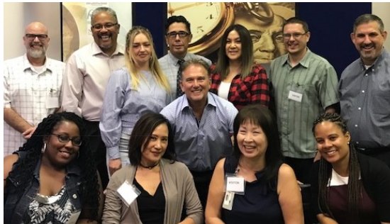
Representatives from our client Anthem visit our corporate team at the Woodland Hills office.